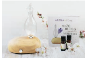
Zéphyr diffuser gift set

The Aqilon unites technology and nature. The understated wooden unit has a touch button for easy use and colour-changing LED lighting to enhance your experience. Its blown glasswork enables you to relax and enjoy the essential oils with its silent anti-splash system.