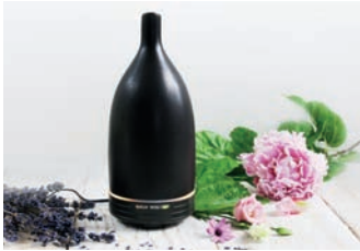
Adapa fragrance mist

The reliable Adapa has a modern and understated design so you can release essential oils in a light mist of water to create a relaxing atmosphere. Warm white light and anthracite grey ceramic. A beautiful, original and modern home accessory.